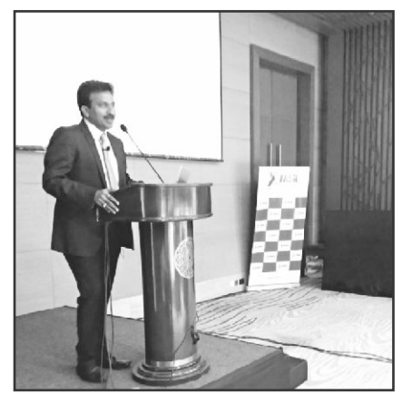
IAP event held at Bangalore on 28<sup>th</sup> April 2018